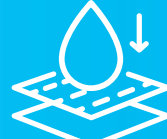
Lead Reduction Carbon Block

1 micron lead-reduction carbon block reduces lead, taste, odor and chlorine.