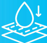
Reverse Osmosis Membrane

Reduces chlorine, chemicals, and pesticides.